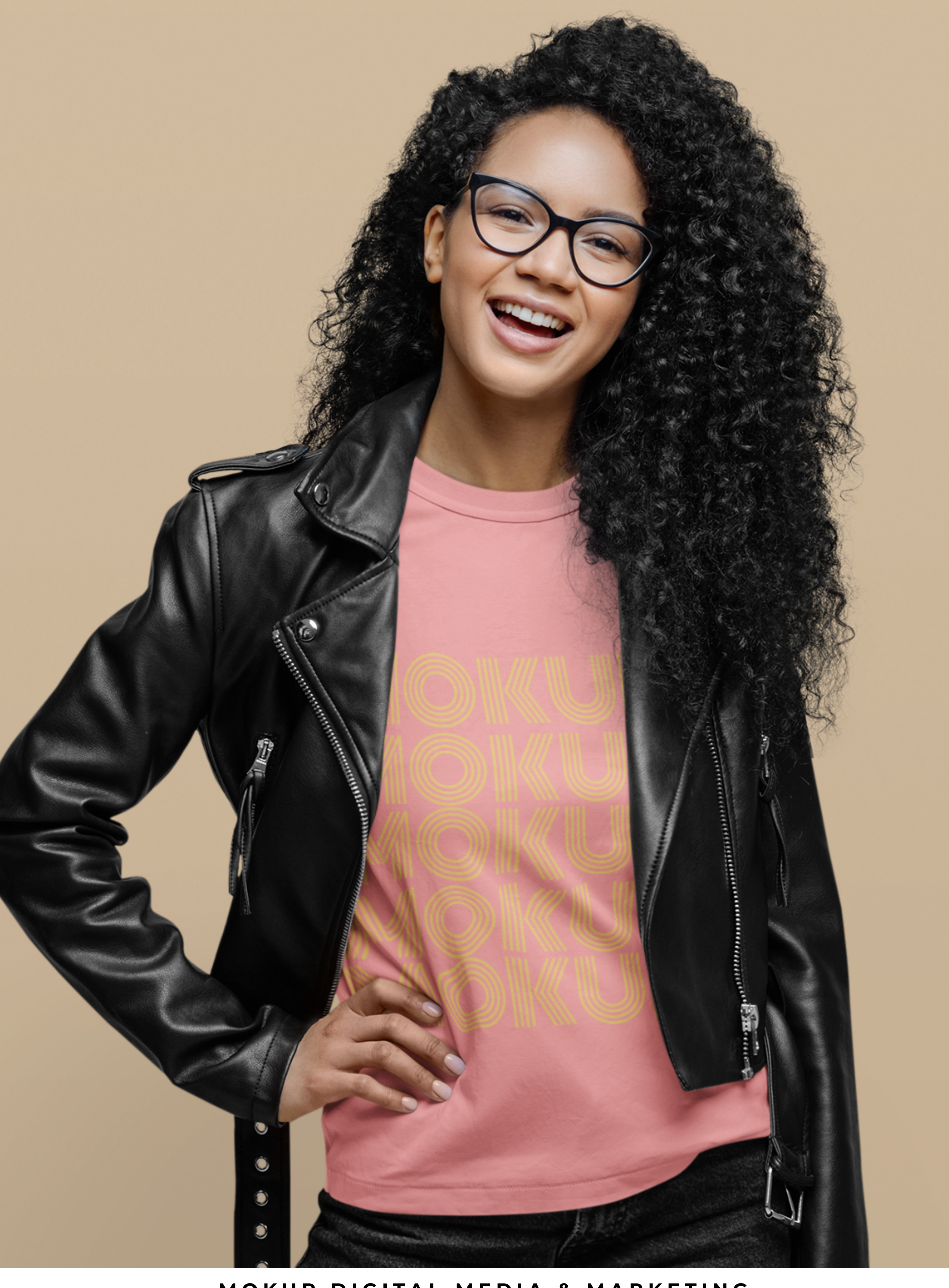
MOKUP DIGITAL MEDIA & MARKETING 2 YEAR ANNIVERSARY ISSUE - JULY 2022